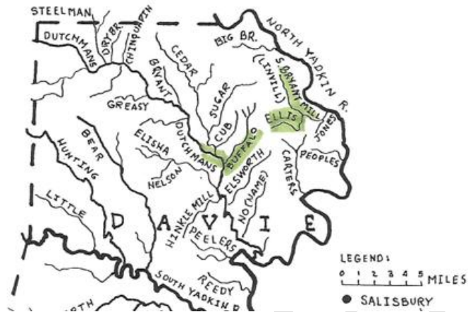
ROWAN COUNTY, NC, VACANT LAND ENTRIES, 1778-1789 Water Courses of Davie and Rowan Counties